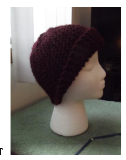
THE LADY LORRI HAT

THIS HAT IN SUPER BULKY WEIGHT YARN IS KNIT FLAT AND SEAMED UP BEFORE STITCHES ARE PICKED UP AND KNIT TO MAKE THE CROWN. THE BRIM IS FOLDED AND SECURED WITH A JAUNTY BROOCH OR BUTTON ABOVE THE EYE. THIS A QUICK KNIT, PERFECT FOR LAST MINUTE GIFTS. I DESIGNED AND KNIT IT IN ONLY 3 HOURS.